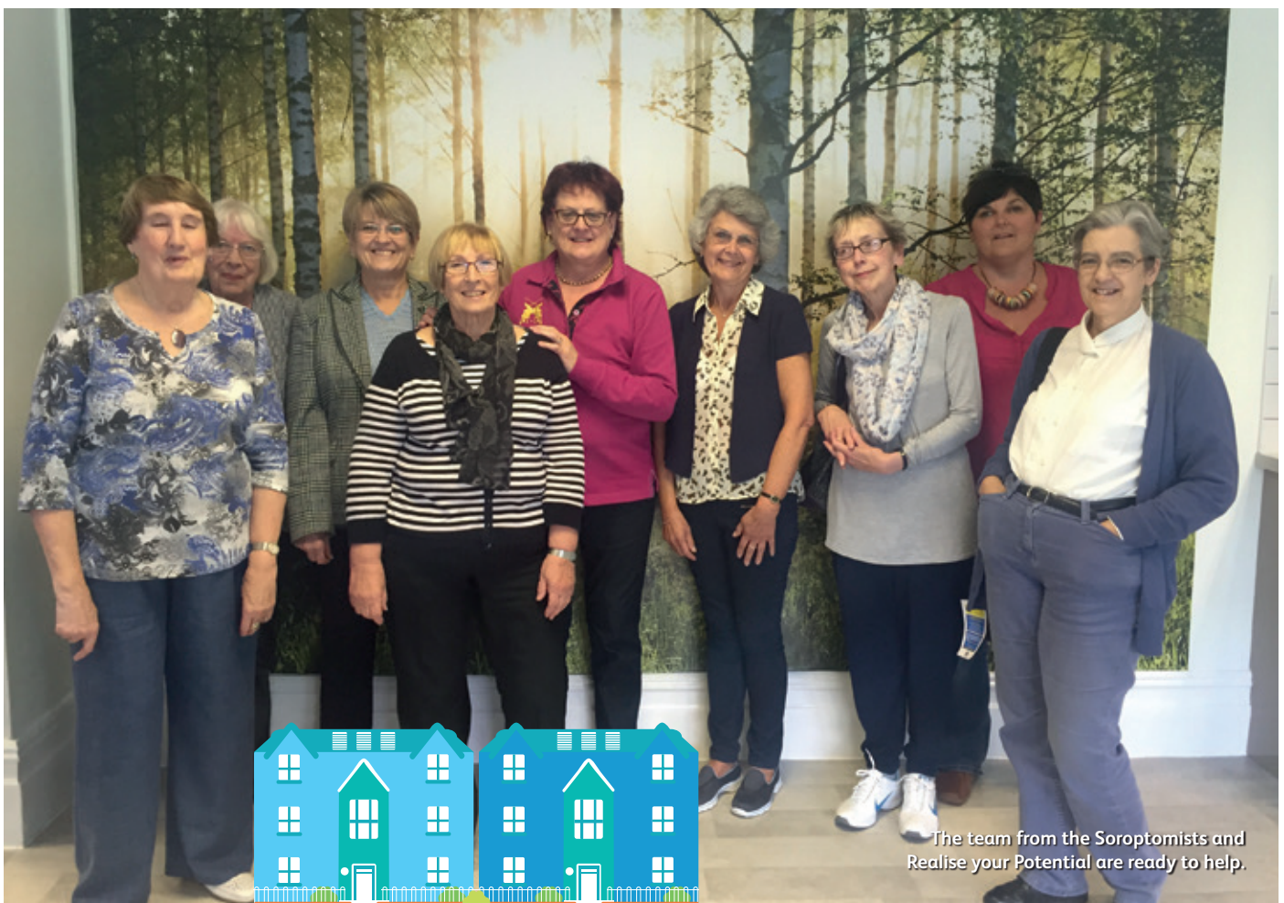
The team from the Soroptomists and Realise your Potential are ready to help.

If you would like to find out more about the course, please call our Realise your Potential Team on 029 2043 4470 or email realiseyourpotential@cadwyn.co.uk